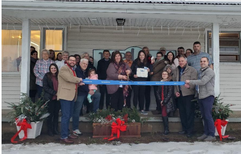
Relax Salon & Spa, Warsaw, NY

Laurie’s Restaurant in Warsaw, one of the locations where customers can enjoy a cup of the locally produced artisan coffee.” -Majestic Hill Coffee Roasters Press Release