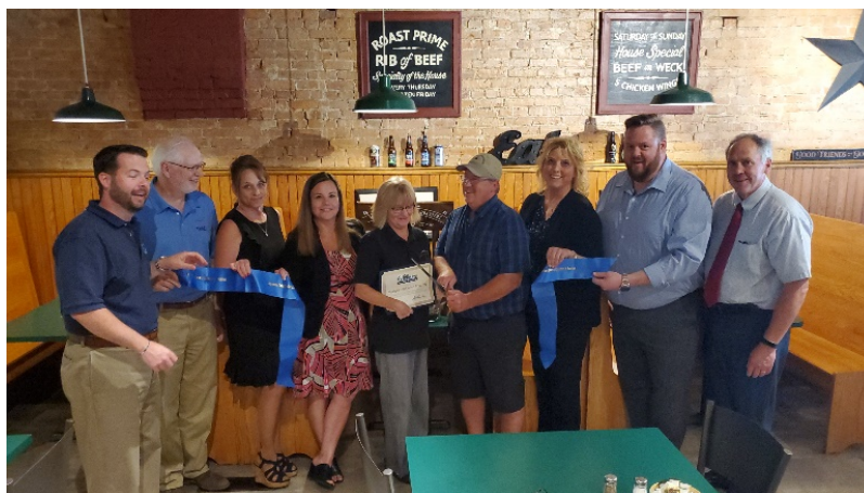
Majestic Hill Coffee Roasters, Castile, NY

The results for the program are quite remarkable since the first offering of this program in 2010. To date 86 businesses have been created or grown resulting in over 160 jobs created or retained. FastTrac helps entrepreneurs transform their innovative business ideas into viable career options, and moves their ventures to reality or new levels of growth. The program helps entrepreneurs overcome barriers and challenges common in starting a business.