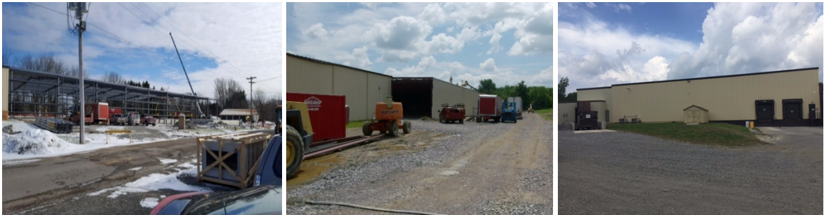
CFI, Properties, Inc. expansion projects