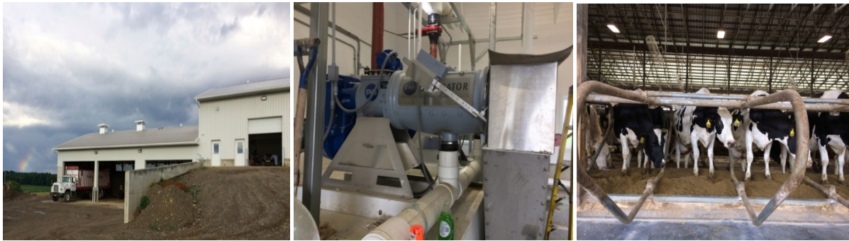
Table Rock Farm – Manure Separator Project- cows enjoying clean bedding from solids.