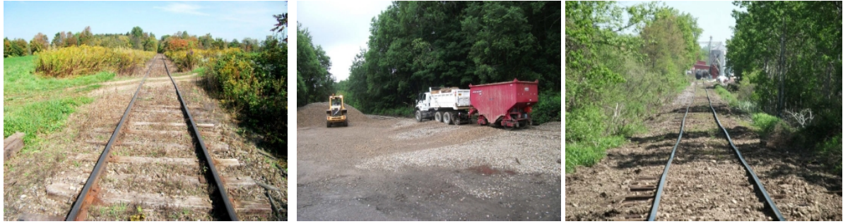
A & A Railroad – Rail project work in progress