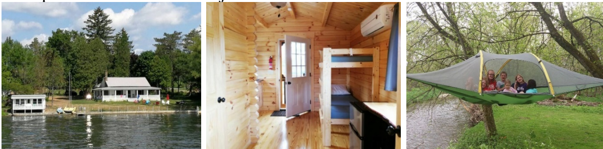
Silverlaken – Glamping and Outdoor Experience at Silver Lake.