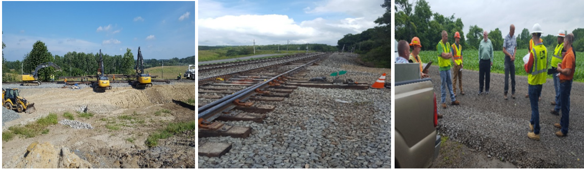
Wyoming County Rail Initiative Project – Gainesville, NY