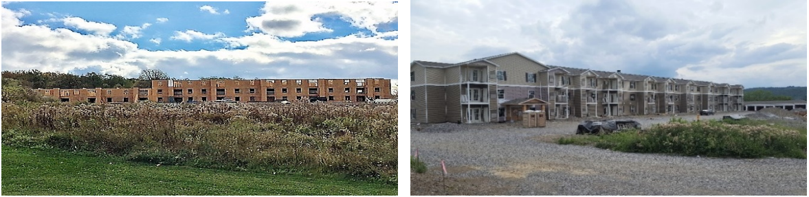
Grandview Terrace -progress pictures for housing project in Warsaw NY

interest and Calamar has reported they have received deposits for apartments on 70% of capacity.