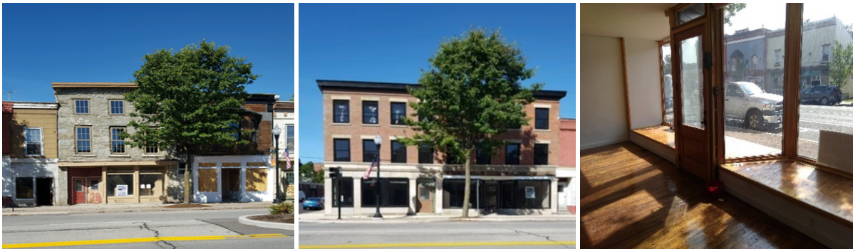
73 Main Street Associates- Perry Project