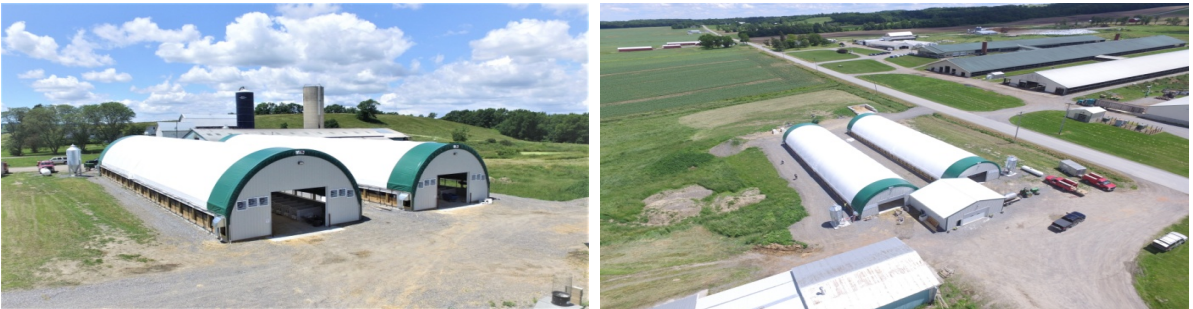
Synergy Genetics LLC- Calf Barns- Linwood Road, Linwood, NY