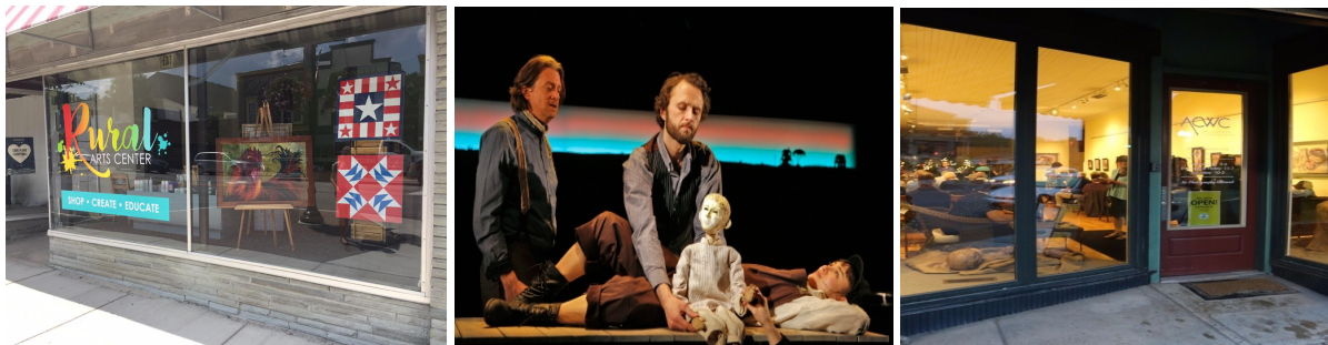
Wyoming County Rural Arts Center, Perry, NY