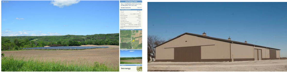
Java Energy LLC- Concept of what facility will look like when complete