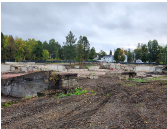
Former Emkay site during cleanup activities