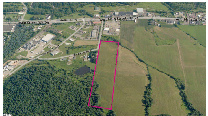
Steele Avenue Business Park, Parcel A (Arcade)

The Committee recently invested funds through an engineering consultant to assess select industrial properties owned by the region's economic development entities and recommending ways to enhance the amenities of the sites for business attraction marketing.