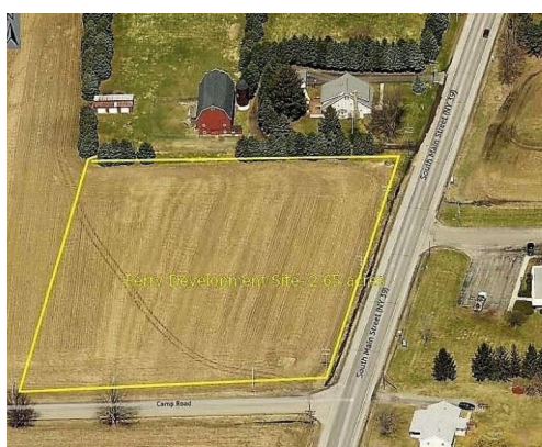
Perry Development Site (Castile)

Wyoming County was fortunate to be selected to submit the Steele Avenue Business Park Parcel A into the group of properties chosen for assessment. This has been completed and we now have several recommendations from the initiative to further improve the viability of the development site for business attraction. Steele Avenue Site B has been identified for a hotel development and the WCIDA is currently in the process to move that project forward.