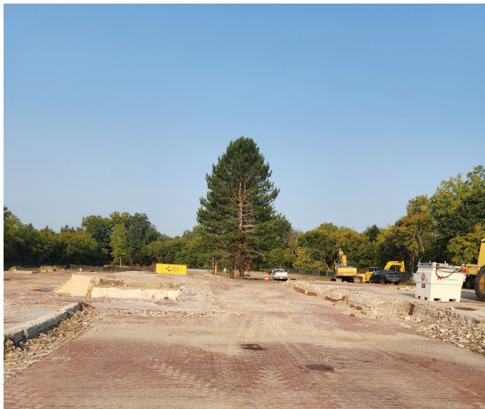
Former Emkay site after cleanup

After the final cleanup, the developer will begin implementing redevelopment plans of the site which most likely will include a mix of housing and commercial development. The WCBC has and will remain engaged in moving this project ahead to ensure compliance and we look forward to the next stages of progress.