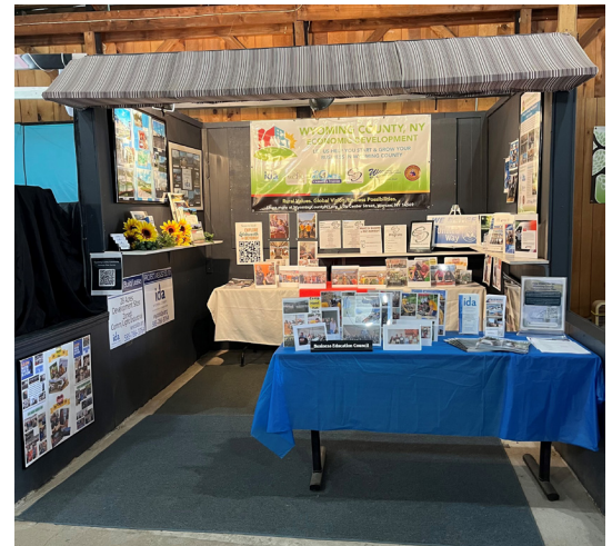
WCBC Fair Booth

The sites that were submitted are matched to the needs of the business prospect and they included the locations like the Pioneer Credit Recovery buildings (Arcade), the vacant API buildings (Arcade), the Perry Development Site (Perry) and the Steele Avenue Business Park Parcel A (Arcade).